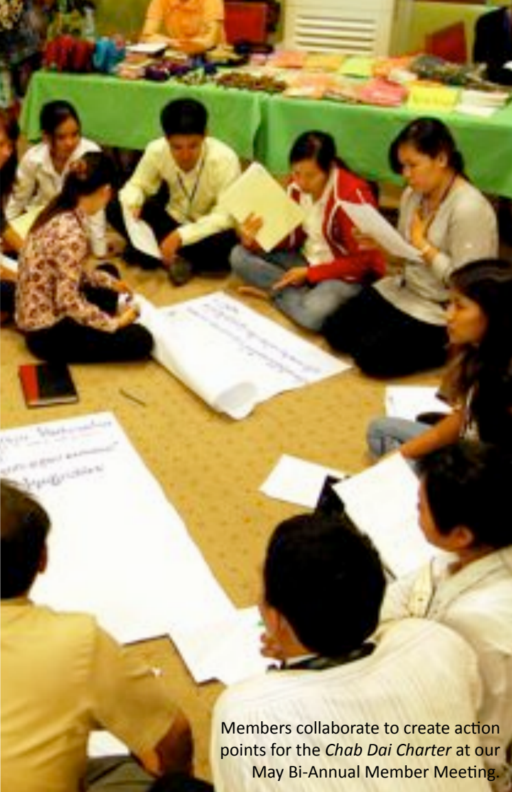
Members collaborate to create action points for the Chab Dai Charter at our May Bi-Annual Member Meeting.

'It's sustainable for Chab Dai to PARTICIPATE with the government in order to protect children in Cambodia... we can DO MORE TOGETHER!'