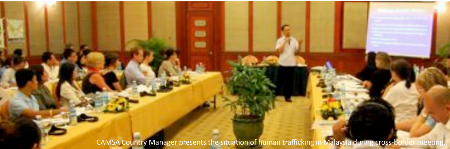
CAMSA Country Manager presents the situation of human trafficking in Malaysia during cross-border meeting.

The Asia Foundation, Tenth Church, Imago Dei, EQUITAS, Child Helpline, CBE International, Erikshlapien, San Jai, RDI Cambodia, CHRF, Child Wise, Promundo, CLSA Chairman's Trust, CAMSA, Good Shepherd, Love 146, APLE, ADHOC, WHI, Viva Network, Ratanak International, PJJ, Samaritan's Purse Canada, UNIAP, Firelighters, CEOP, Australian Baptist World Aid, Tenaganita, LSCW, COSECAM, Headington Institute, IOM, M'Loop Tapang, World Vision Cambodia, FELM, Sunrise Community Church, LICADHO, HCC, Chab Dai Yejj Charitable Trust, Giving Hands, Royal Government of Cambodia, & our Cambodian members!