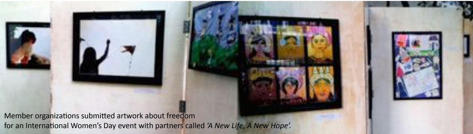
Member organizations submitted artwork about freedom for an International Women's Day event with partners called 'A New Life, A New Hope'.

Aim: To clearly understand issues and emerging gaps, in order to speak up on behalf of vulnerable people.